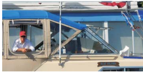
Ready to cruise the Delta.